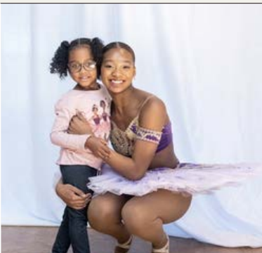
Meet an Ambassador