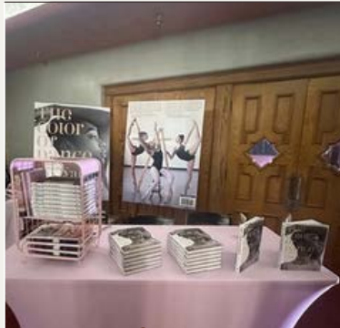
Book Signing and Photo Gallery