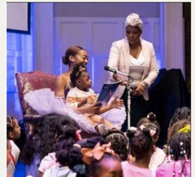
Story Time w/ a Brown Ballerina