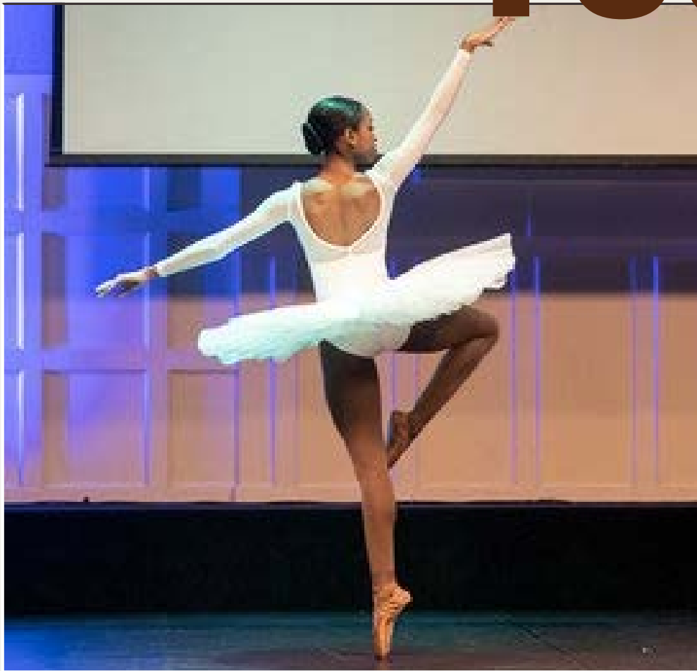
Photo from the 2023 Ballerina's Brunch in Houston, Texas